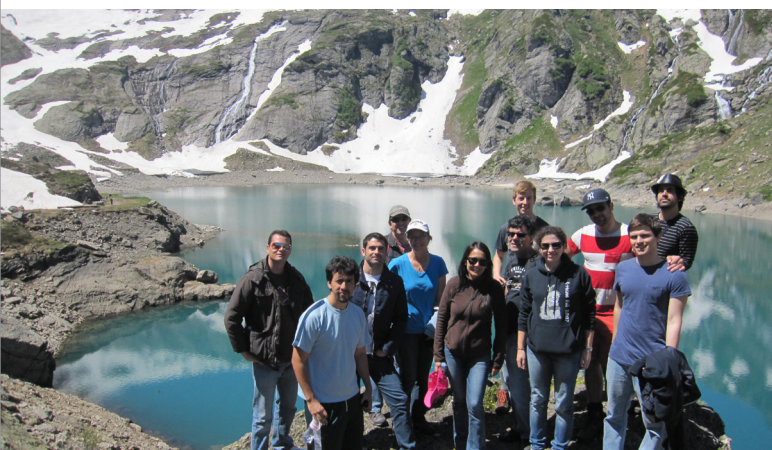
MAS student class 2013/2014 at Maggia Valley (C. Góez)