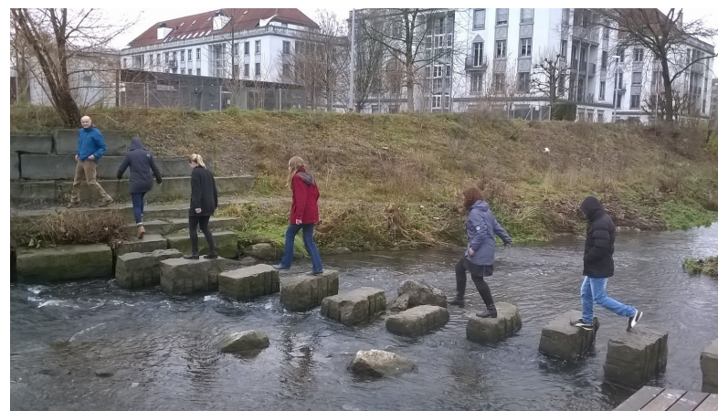
MAS student class 2015/2016 at EAWAG (D. Molnar)