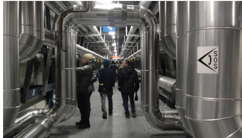
MAS student class 2015/2016 at Zurich's wastewater treatment plant

Elective courses serve to broaden specialized knowledge and to gain further insight and skills useful for the successful completion of the research thesis. These courses are selected from MSc courses in Environmental Engineering, in Environmental System Science, and other ETH departments. The courses emphasize different aspects of water and Climate, Snow and Ice, Ecology and Ecosystems, Policy, and more.